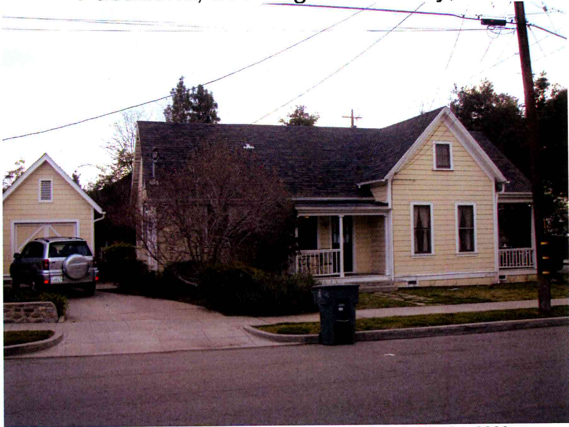
CA_Los Angeles County_Bristol-Cypress Historic District_0003