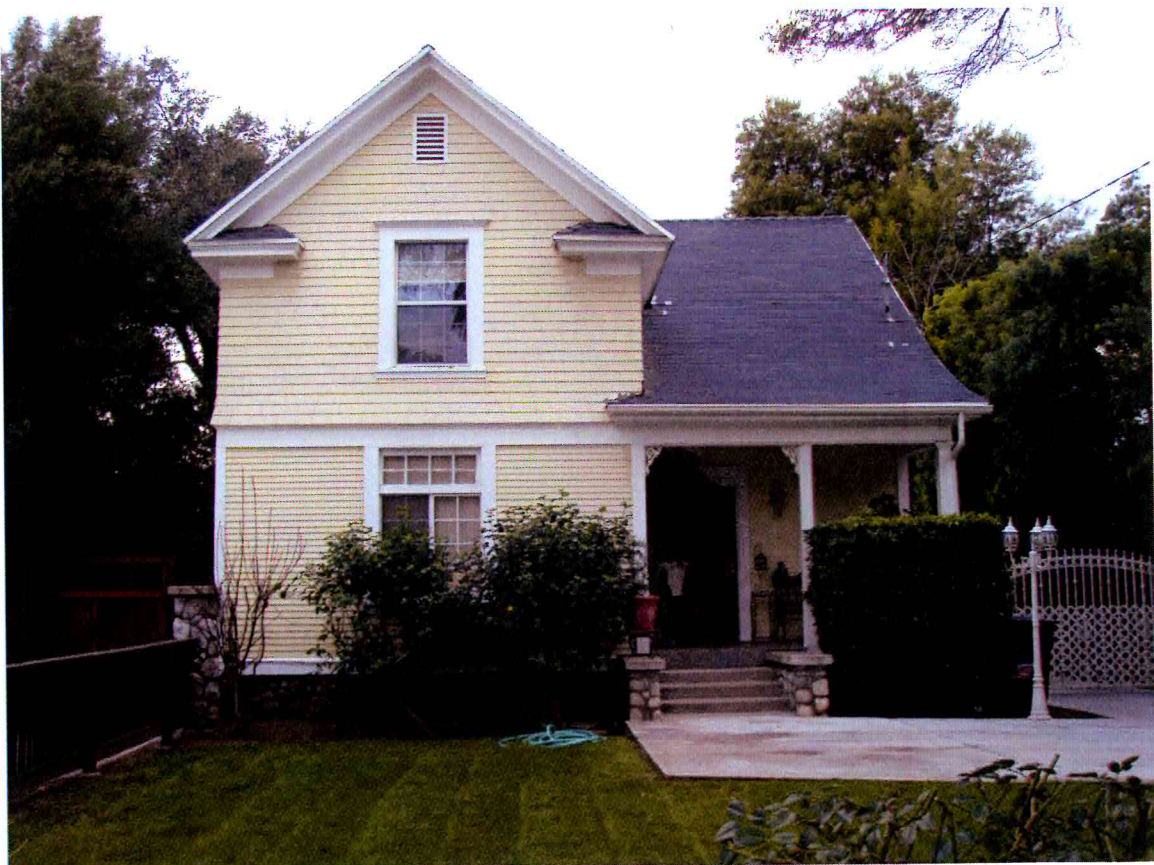
CA_Los Angeles County_Bristol-Cypress Historic District_0006