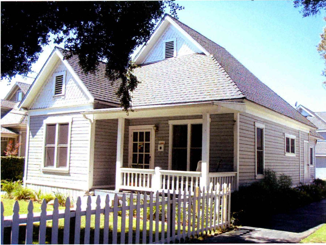
CA_Los Angeles County_Bristol-Cypress Historic District_0009