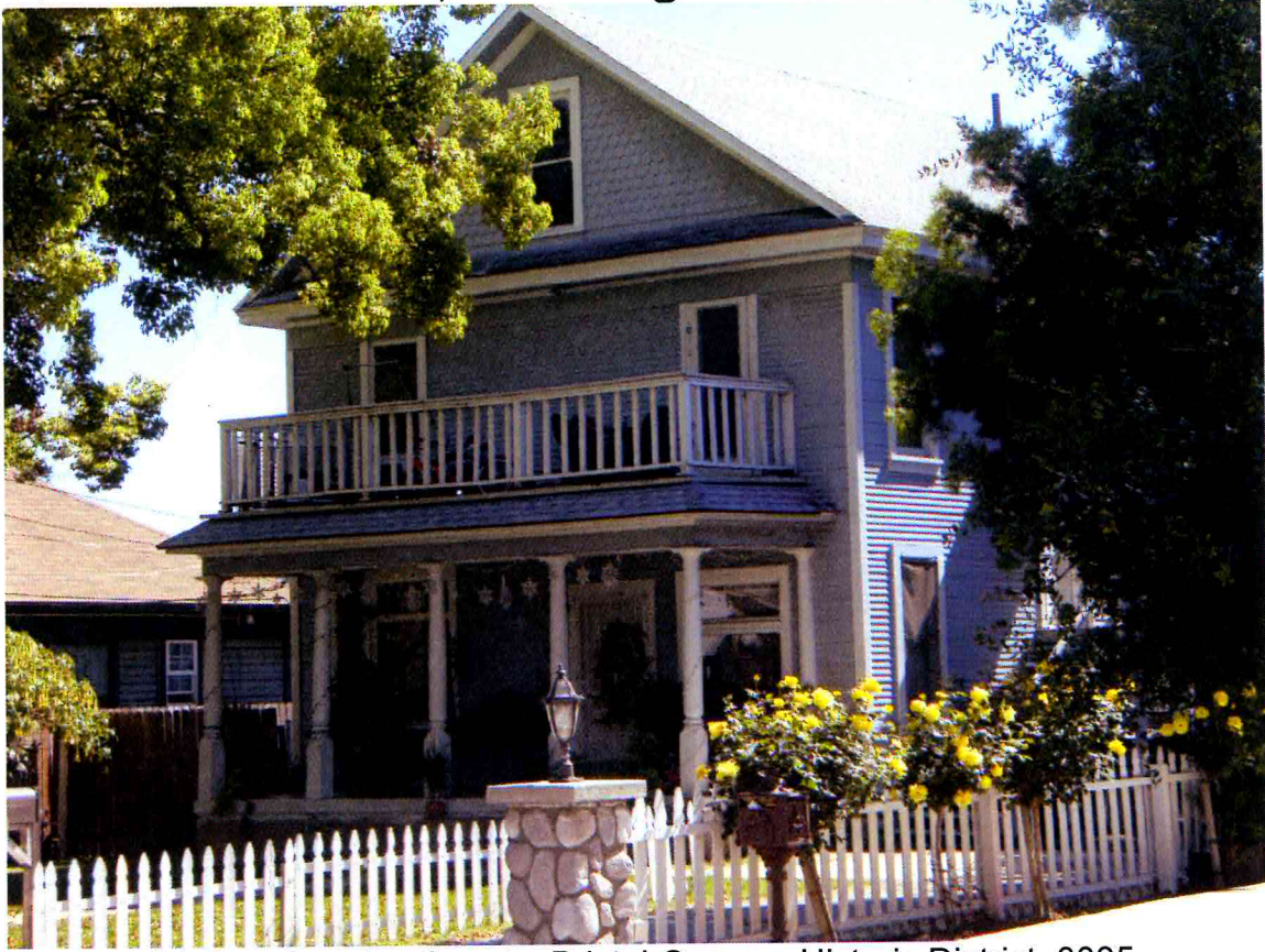
CA_Los Angeles County_Bristol-Cypress Historic District_0005