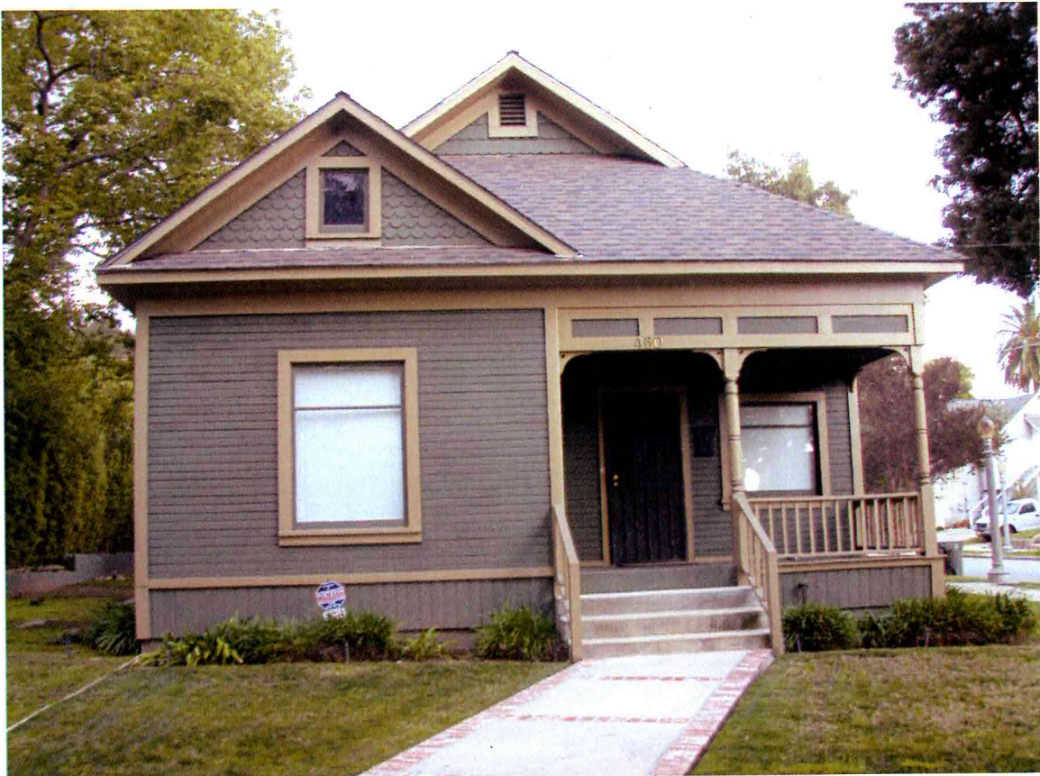
CA_Los Angeles County_Bristol-Cypress Historic District_0004