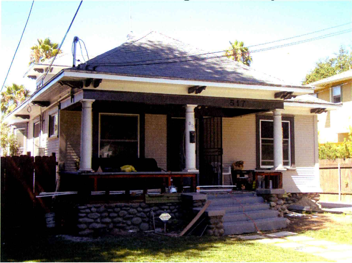
CA_Los Angeles County_Bristol-Cypress Historic District_0011