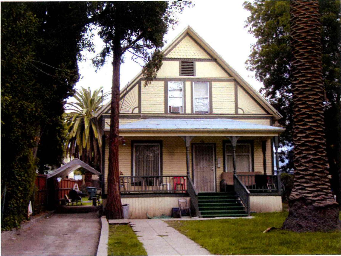
CA_Los Angeles County_Bristol-Cypress Historic District_0007