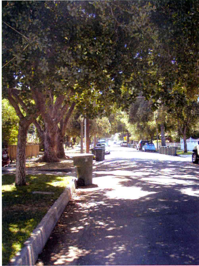
CA_Los Angeles County_Bristol-Cypress Historic District_0001