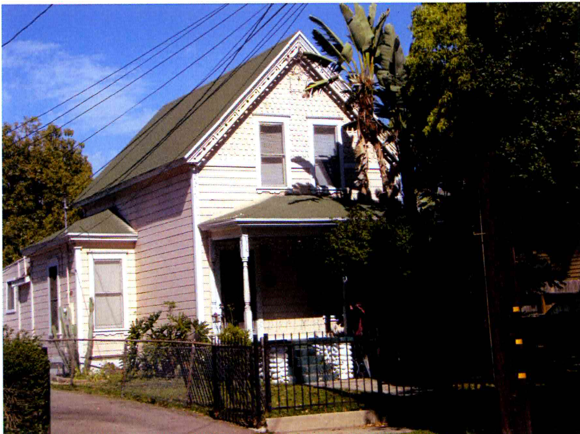
CA_Los Angeles County_Bristol-Cypress Historic District_0010