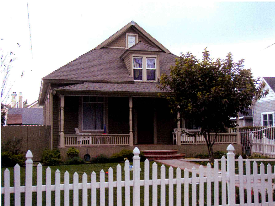
CA_Los Angeles County_Bristol-Cypress Historic District_0008