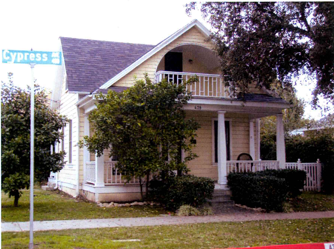
CA_Los Angeles County_Bristol-Cypress Historic District_0002