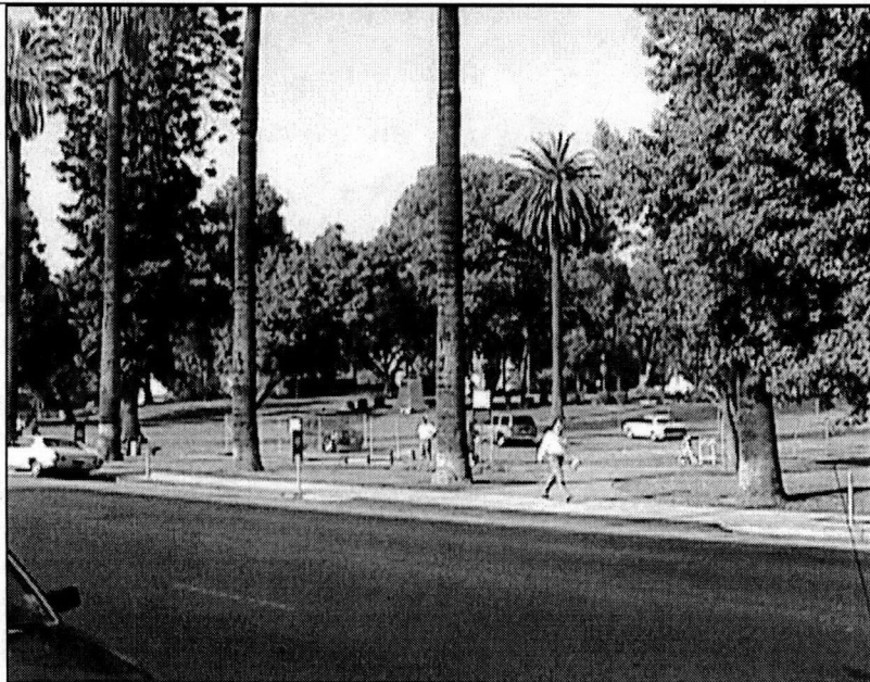
P5a. Photograph or Drawing (Photograph required for buildings, structures, and objects)

P4. Resources Present Building Structure Object Site District Element of District Other (Isolates, etc.)